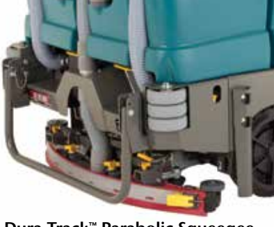
Dura-Track ™ Parabolic Squeegee