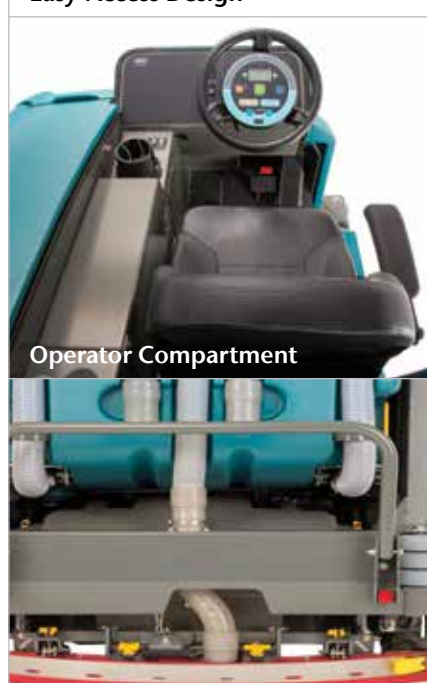
Yellow Maintenance Touch Points

Overhead guard protects operators from falling objects.