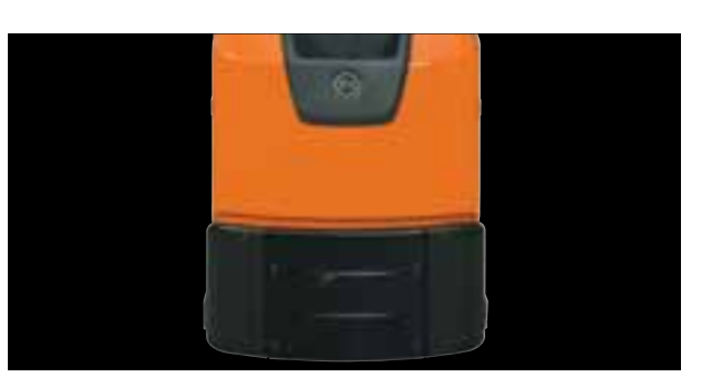
The OME100N's narrow chassis is robust and reliable – ideal for 'free ranging' operation