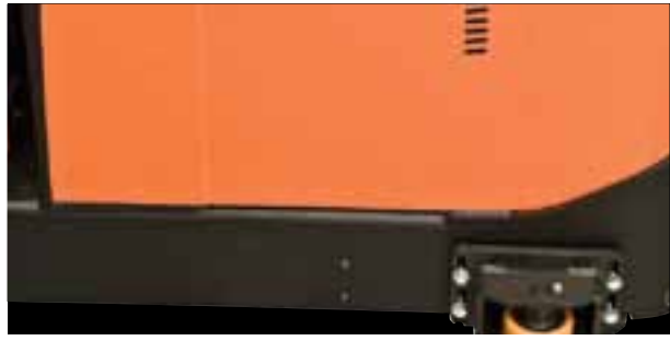
All exterior parts are made of steel, for strength and protection

Periodic maintenance is a requirement for all forklift trucks, but the BT Optio H-series is designed for long service intervals. For example, its AC motors are brushless and its gearbox oil will never need to be replaced. At the end of its life, BT Optio H-series is 99% recyclable.