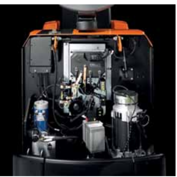
L-series models have excellent service access, helping to keep your operation running