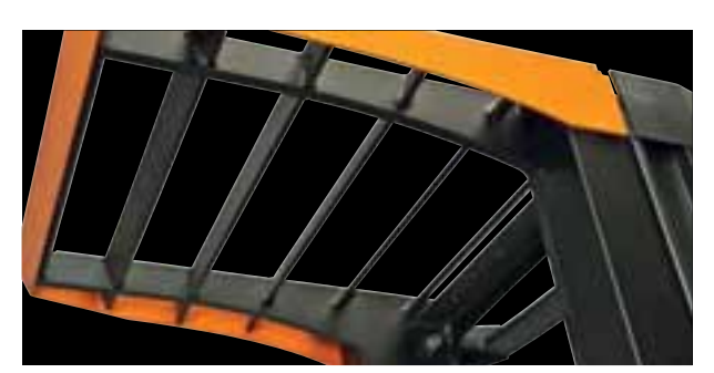
The overhead guards on M-series 'M' and 'N' models offer full protection for the operator without impeding his or her view

The BT Powerdrive system with advanced AC motors on 'N' models provides reliability and simplicity. CAN-Bus technology means fewer parts and reliable motor and system control. Routine and emergency maintenance is straightforward, with easy access to all components.