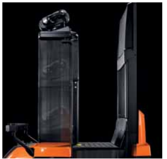
BT Optio L-series models with elevating platforms also have elevating controls, allowing manoeuvring and driving without having to lower the platform

The BT Powerdrive system means that as soon as the E-man control handle is released smooth progressive braking is applied, to ensure smooth, responsive control.