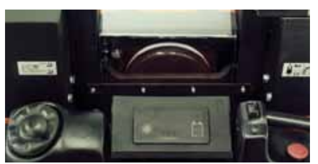
The comprehensive display shows lift height, battery status and drive-wheel position as well as warning and error codes