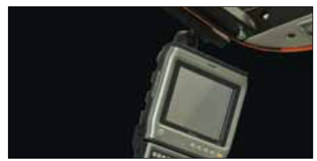
The unique E-bar can be specified in a number of locations for mounting and powering devices such as computers and barcode scanners