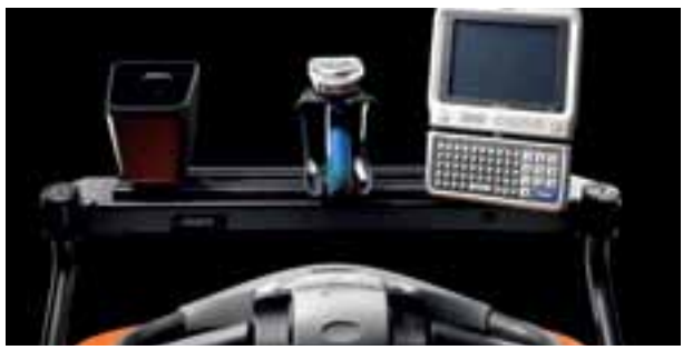
The BT Optio L-series E-bar option allows the mounting and powering of ancilliary equipment such as computers and barcode scanners