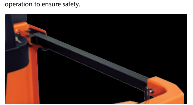
All M-series models feature folding side gates (optional on OME100N and OME100)

The BT Powerdrive system means that as soon as the E-man control handle is released smooth progressive braking is applied, to ensure smooth, responsive control.