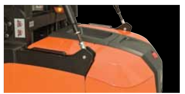
Non-exposed parts, such as the battery cover, are made of plastic to save weight