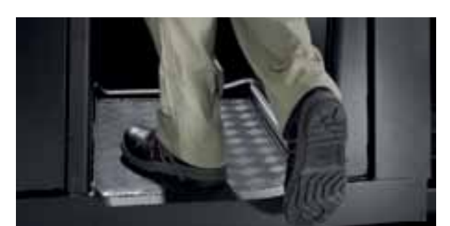
BT Optio's low step-in height reduces the strain of repeatedly stepping into and out of the truck. The floor is suspended to reduce vibration, helping some applications meet legislative requirements

The optimised truck performance system on the BT Optio L-series automatically adapts speed when cornering to allow fast yet safe driving in all conditions.