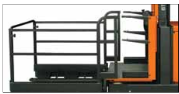
M-series 'W' models have a 'walk-through' design for picking bulky articles

All BT Optio M-series trucks offer an optional E-bar, which allows the mounting (with power supply) of ancillary equipment such as PCs and barcode readers.