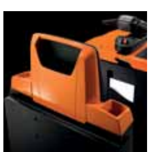
BT Optio L-series offers useful front and rear storage compartments. The front compartment even has a rest for shrinkwrap

the steering radius is automatically reduced when the truck is pedestrian controlled.